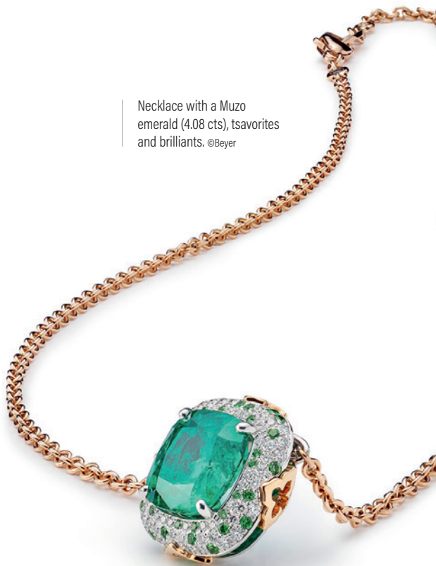
Necklace with a Muzo emerald (4.08 cts), tsavorites and brilliants.