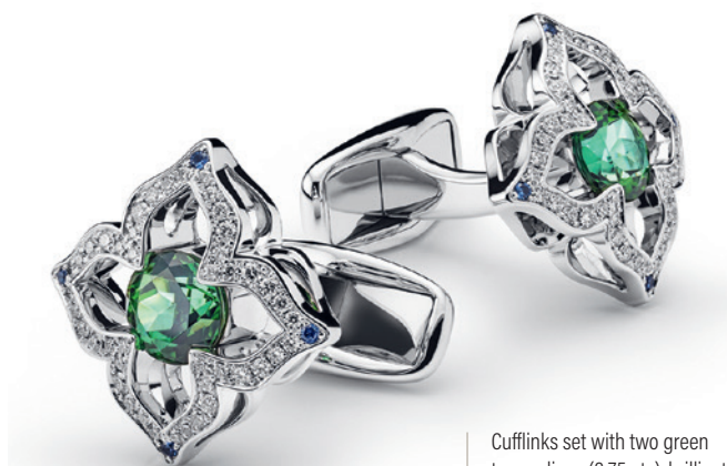
Cufflinks set with two green tourmalines (2.75 cts), brilliants and sapphires.

The Ornamenta high jewellery collection by Beyer, the oldest watch retailer in the world, can be seen as a declaration of love for Zurich. Every piece in the collection – rings, necklaces, earrings and cufflinks – is modelled after an architectural feature of the city's historic buildings. This first chapter draws inspiration from the Fraumünster.