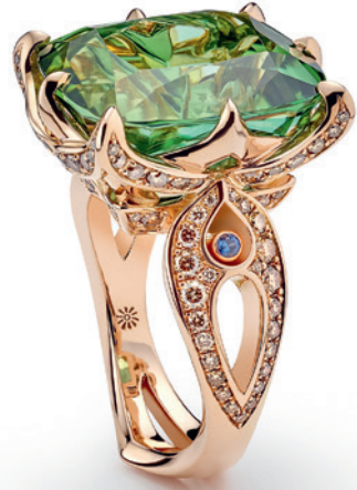
Ring with a green tourmaline (18.76 cts) and 118 brilliant-cut champagne diamonds.