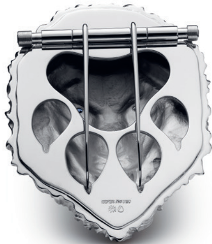
The Tribute to Zurich brooch, in white gold with a sapphire and a brilliant-cut diamond, is inspired by the lion on the city's coat of arms. Limited edition of five.